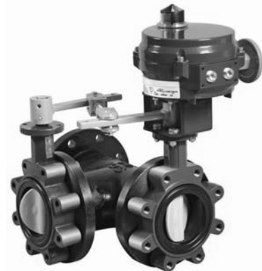
Three-Way, Industrial-Grade, Non-Spring-Return, VA-907x Series Electrically Actuated, Standard-Pressure, Standard-Temperature Butterfly Valve Assemblies

If the VF Series Butterfly Valve Assembly fails to operate within its specifications, refer to the VF Series Standard-Pressure, Standard-Temperature Butterfly Valves Product Bulletin (LIT-977205P) for a list of repair parts available.